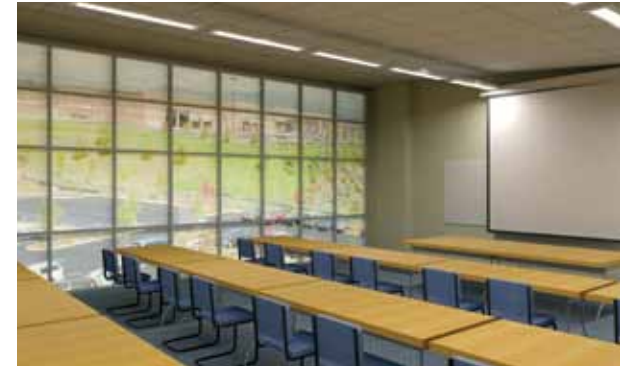
Smart classrooms for off-site training

A fully equipped circular kitchen is available for use with your meeting, conference or event. The kitchen is located near and has access to the large, first floor meeting/exhibit room. The kitchen can also be rented as a stand-alone teaching facility. Our staff can help in making these arrangements.