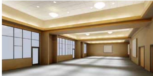
3,420 square-foot meeting/exhibit room can be configured to accommodate 400 in standing reception format, 378 in theater-style seating, 120 in classroom-style seating, or 55 exhibitor booths.

We offer a wide and flexible choice of meeting room accommodations— attractively priced—to meet every corporate or organizational need.