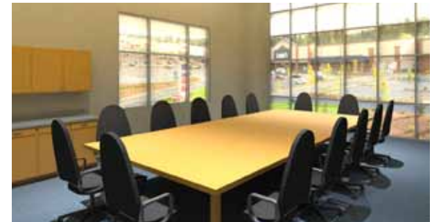
Conference rooms for webinars and teleconferencing