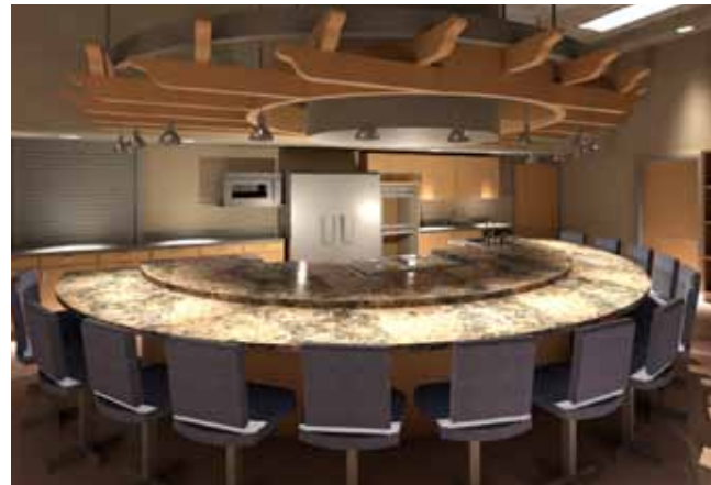
Fully equipped, state-of-the-art teaching and retreat use kitchen

A fully equipped circular kitchen is available for use with your meeting, conference or event. The kitchen is located near and has access to the large, first floor meeting/exhibit room. The kitchen can also be rented as a stand-alone teaching facility. Our staff can help in making these arrangements.