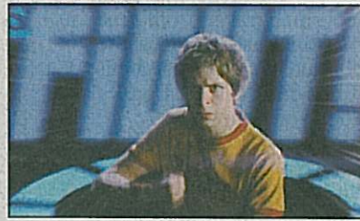
Michael Cera stars in "Scott Pilgrim vs. The World."