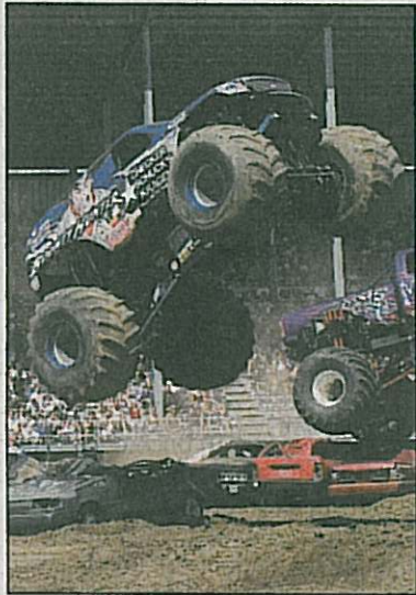
Bounty Hunter jumps over four cars at a past Clark County Fair.