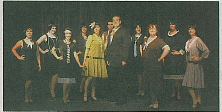
The New Blue Parrot Theatre presents "Thoroughly Modern Millie" through Aug. 21 at Washougal High School's Washburn Performing Arts Center in Washougal.