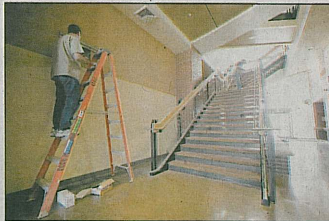
Scott Root, a Clark College technician, installs a plasma-screen display at Clark's new Columbia Tech Center classroom building in east Vancouver.