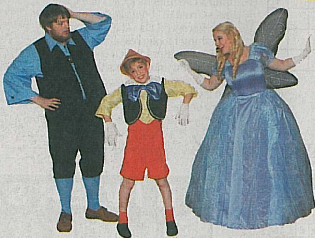
Christian Youth Theater presents "Disney's My Son Pinocchio" through Dec. 11 at the Washburn Performing Arts Center in Washougal.