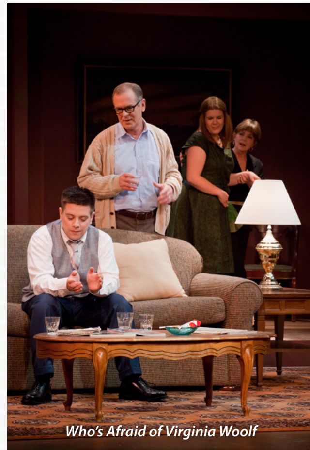
Who's Afraid of Virginia Woolf