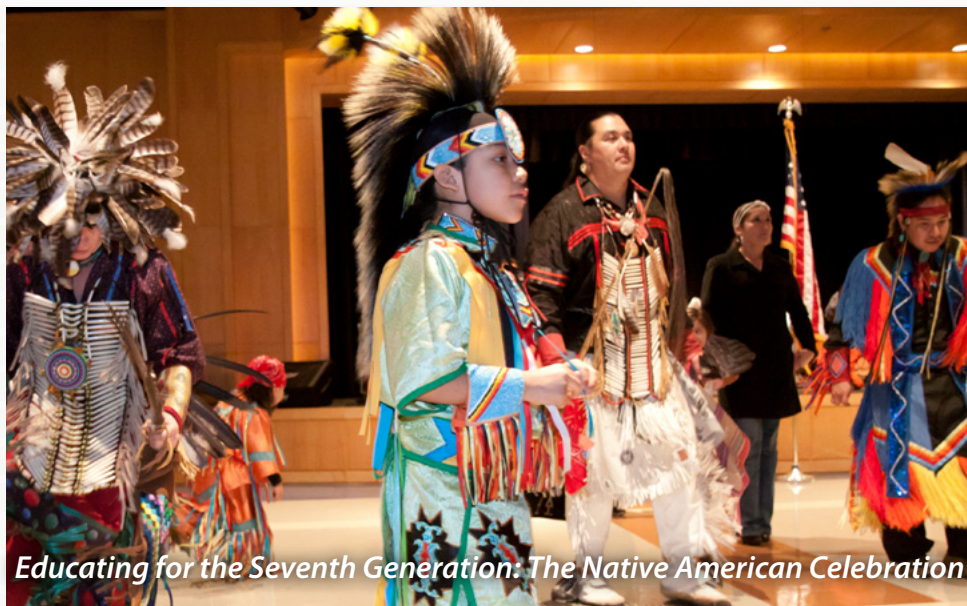
Educating for the Seventh Generation: The Native American Celebration