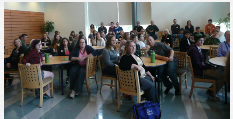
FYE mentees and mentors meet up to introduce themselves and eat ice cream.