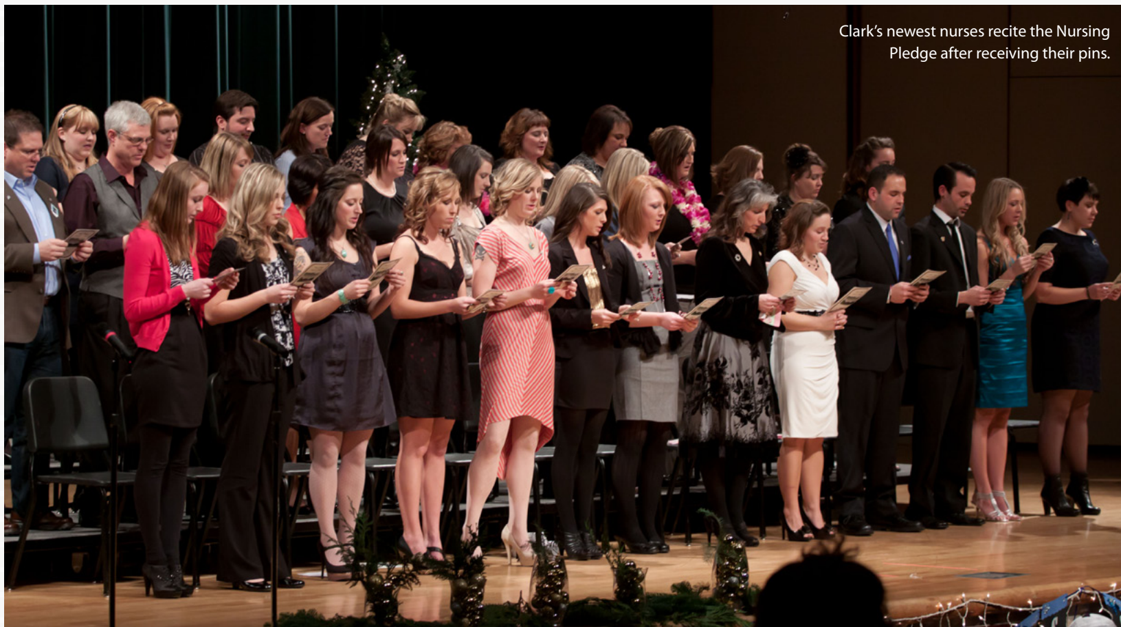
Clark's newest nurses recite the Nursing Pledge after receiving their pins.

The pinning ceremony for Clark College Nursing's 109th graduating class begins festivities for a major anniversary