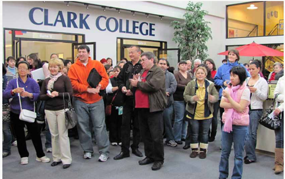
More than 100 students gathered for their chance to win a Random Assistance gift card at Town Plaza.