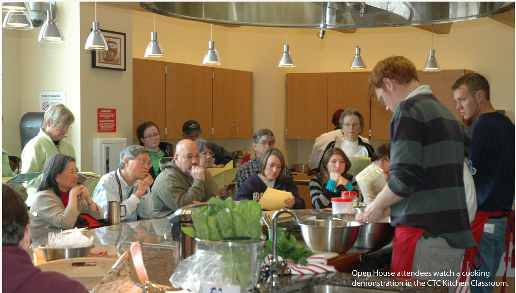
Open House attendees watch a cooking demonstration in the CTC Kitchen Classroom.

of “local” vary, but generally involve a radius of somewhere between 100 and 250 miles. By eating locally, most locavores hope to create a greater connection with food sources, resist industrialized and processed foods, and support local small agricultural economy.