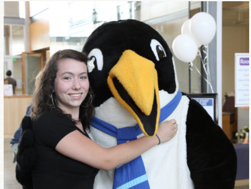
Oswald greets a new member of the Penguin Nation during the Clark College Bookstore's Running Start Open House event on August 25.