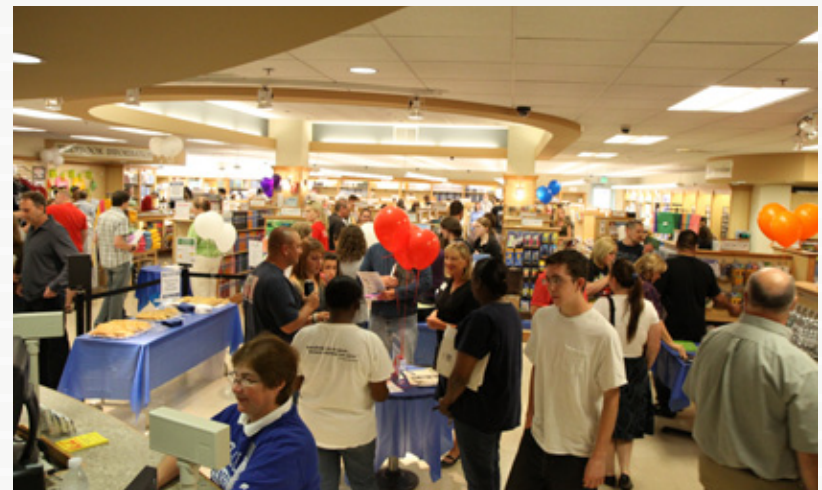
Approximately 200 people attended the open house, circulating through the bookstore to learn about textbook affordability options, eLearning and Cannell Library, as well as purchase books and supplies.