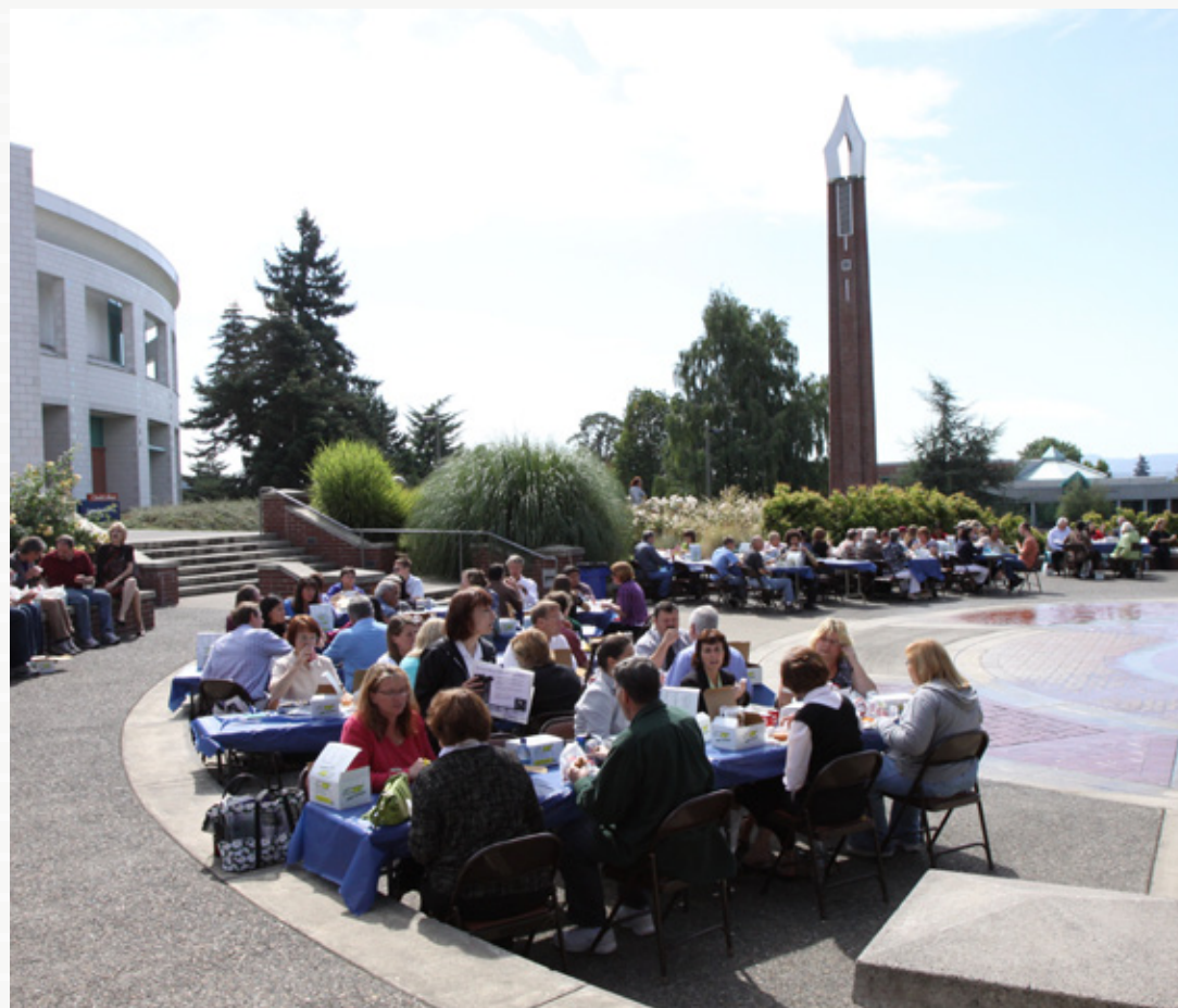
An opening day tradition—gathering on Andersen Fountain Plaza to share lunch and kick off the new academic year.

For 2009-2010, the opportunities to serve students continue to grow. The open house at Columbia Tech Center was a great success, and classroom seats in the new building are filling quickly. To date, fall quarter enrollment is up approximately 35% over last year; the college is also welcoming its largest