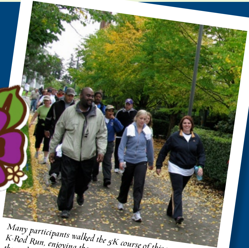
Many participants walked the 5K course of this year's K-Rod Run, enjoying the scenery as the course wound its way through the Clark College main campus.