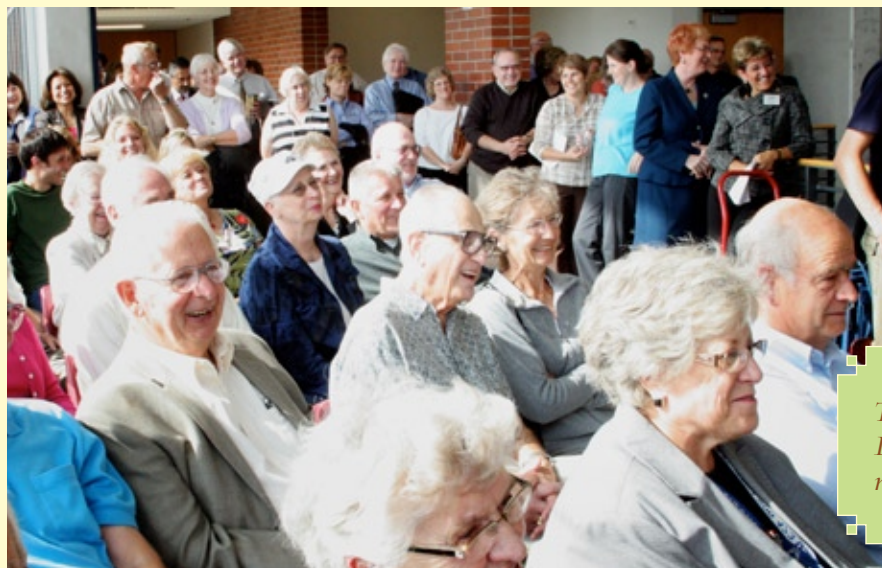
The gathered crowd watches as the Ellis F. Dunn Community Room is dedicated in the newly remodeled Gaiser Hall.