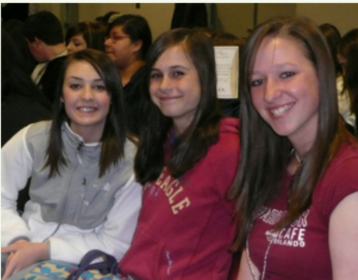
Three high school students wait in the Student Center for the opening session to begin.

Students had the opportunity to attend four presentations of their choosing and were excited to hear from a variety of institutions. This was Clark College's first turn hosting this annual event, which was a success. Even the weather cooperated, making it a beautiful day for students to visit our college. ■