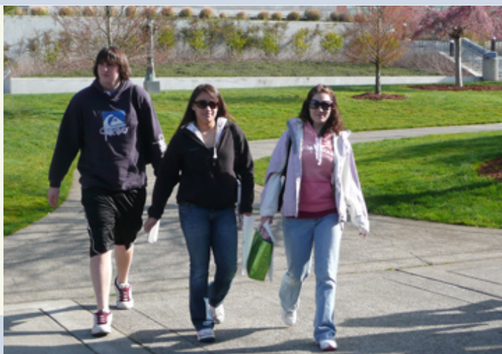
Students walking to their next college presentation.