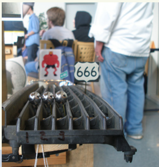
A close-up of “Journey Through the Afterlife,” one of 15 team projects entered in the winter quarter engineering club competition.

On Tuesday, March 11, approximately 60 Clark College students participated in the quarterly engineering club competition. Students presented 15 team projects that they believe Mr. Goldberg himself would have enjoyed. The event, which was held in the Penguin Student Lounge, drew an audience of observers as well, including The Columbian, which covered the event in its Mar. 12 edition.