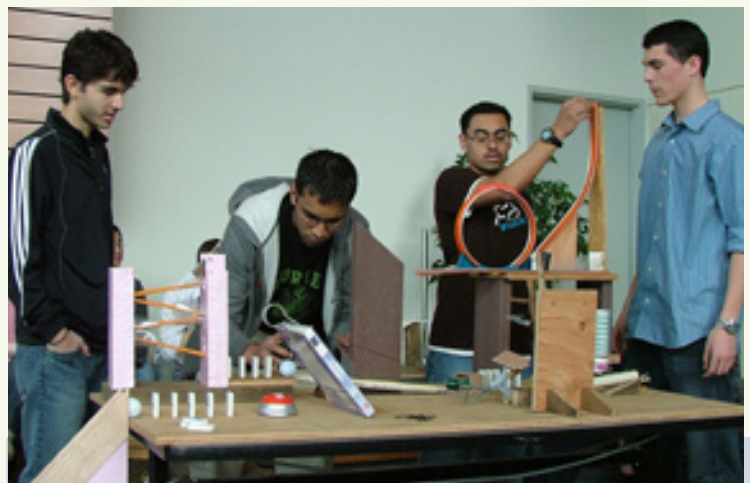
Students were given a limited amount of time to set up and test their Rube Goldberg machine. Scores were based on the number of steps and score achieved from hitting the target.