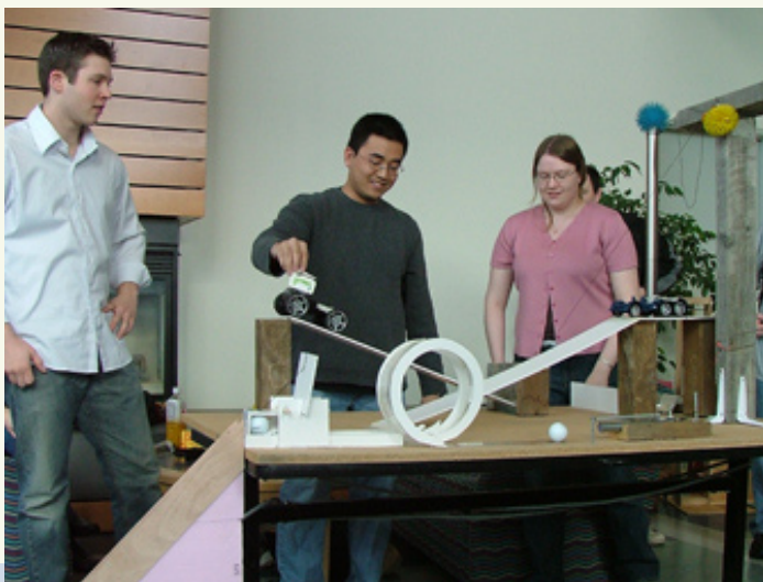
Clark students tested their engineering skills during “Golfing with Rube” – the winter quarter Engineering Club competition held Mar. 11.

The Merriam-Webster dictionary defines “Rube Goldberg” as accomplishing by complex means what seemingly could be done simply. The definition honors the Pulitzer Prize-winning cartoonist, sculptor, and author whose inventions offered, as his official Web site notes, “a unique commentary on life’s complexities” by lampooning the wonders of technology.