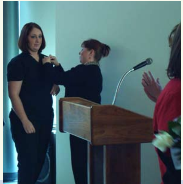
The dental hygiene program's pinning ceremony marks a milestone in the training of first-year students. This year's ceremony was held Feb. 20 in the Penguin Student Lounge.

These students are now ready to begin treating patients from the community in our clinic under the supervision of dental hygiene faculty. This is a major accomplishment as our class of 2009 continues their education journey toward becoming licensed dental professionals. ■