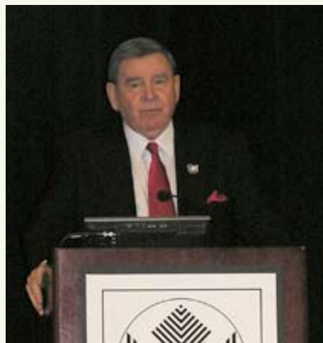
Vancouver Mayor Royce Pollard focused on the future during his 2008 State of the City address.