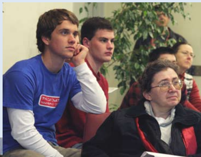
Students listen intently to the study abroad presentations held in the PUB Student Lounge.