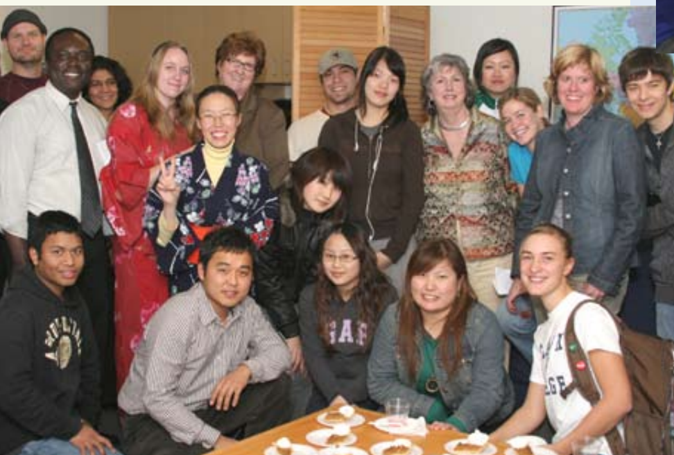
Staff, students and faculty enjoy some pumpkin pie at the International Program's open house event.