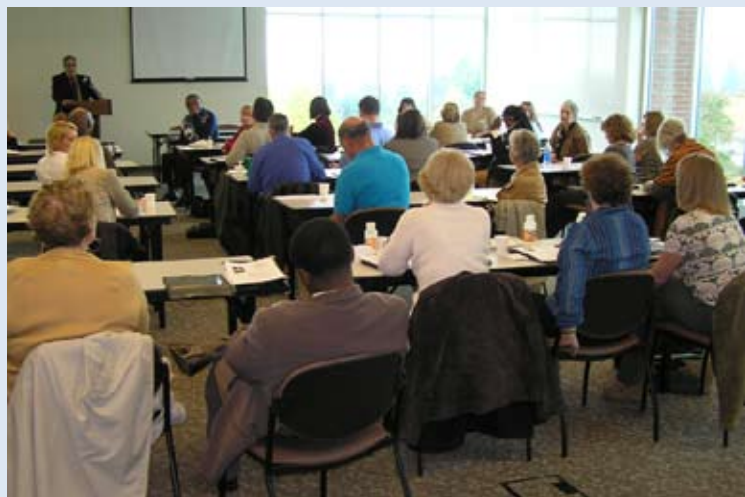
Representatives from 27 colleges attended the annual statewide Worker Retraining conference, held at Clark College on October 12.

Clark College is one of only six Washington community and technical colleges that has met and exceeded its enrollment targets for worker retraining for the last two years.