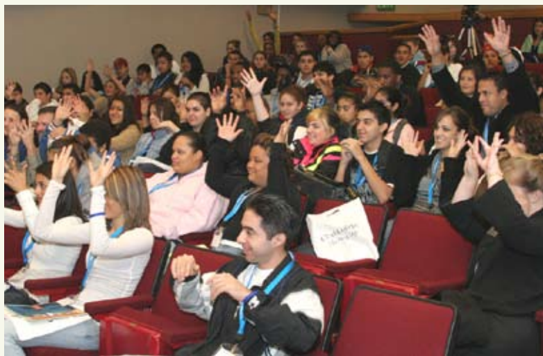
During the Gateways recruitment event, students attended program information sessions, went on campus tours and visited with Clark College faculty, staff and students.