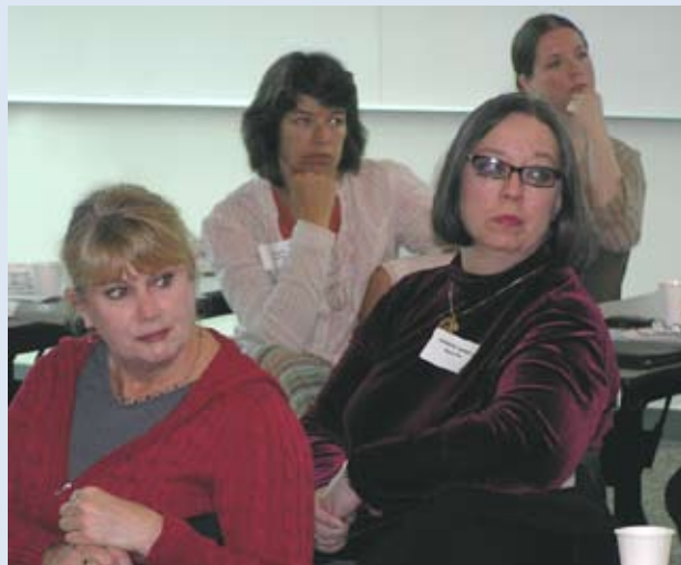
The Worker Retraining conference provided attendees the chance to learn more about the topics of eligibility, marketing and recruiting.