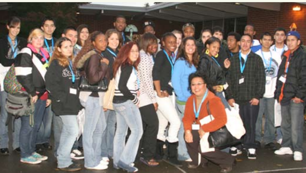
Students from Vancouver and Portland high schools attended the first Gateways: Student of Color Open House, held October 19 at Clark College.

On Friday, October 19, approximately 115 students visited Clark College as the Office of Student Recruitment held the first Gateways: Student of Color Open House. This new visitation program is intended for prospective students of color who are currently in grades nine through 12.