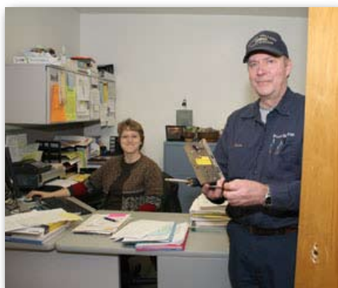
A common site in these early days of the T building: working in the office while working on the office.

Signage has been posted outside the T building to assist students and campus visitors in locating services, and an updated map has been posted to the Clark College Web site ( www.clark.edu/moves ). Here is a summary of recent and pending moves: