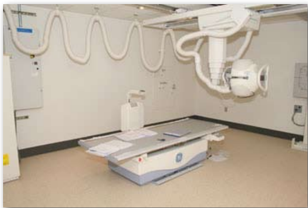
Future home of the medical radiography program, the T building houses two x-ray machines that will be used to train students.