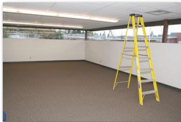
A future classroom for the medical radiography program.