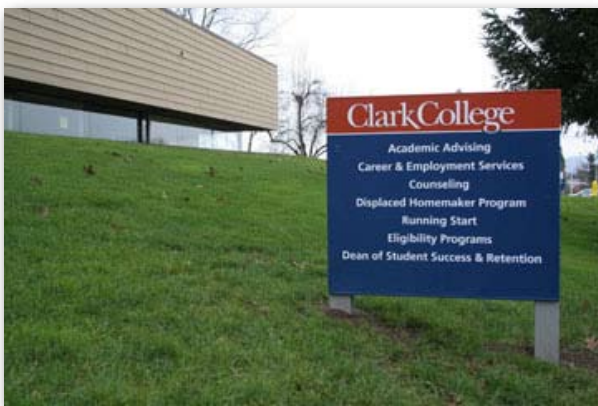
Signs outside the T building inform students and visitors of the new inhabitants of the former Clark County Social Services Center.