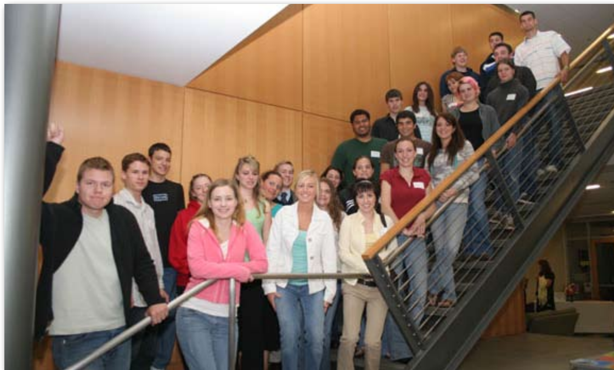
The 2006 Running Start graduating class

High school sophomores and juniors can learn how to take the next step in their education by attending the Running Start Information Night on Tuesday, February 6, from 6:30 p.m. to 7:30 p.m. in the Clark College gym.