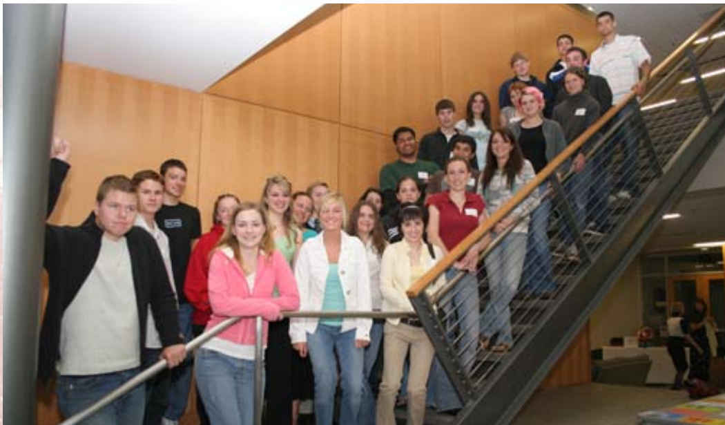
2006 Running Start Class