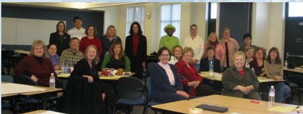
Members of the 2006 Supervisory Boot Camp were so excited about the program they wanted to capture their experience for the history books.