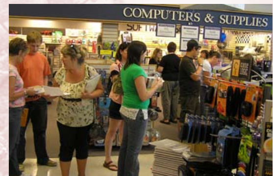
Students quickly move through the long lines