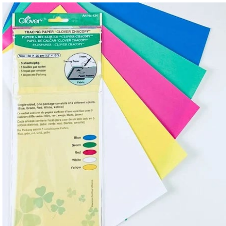
One package of wax free tracing paper