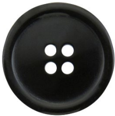
Button, 1" size with "holes" in the center (any color)