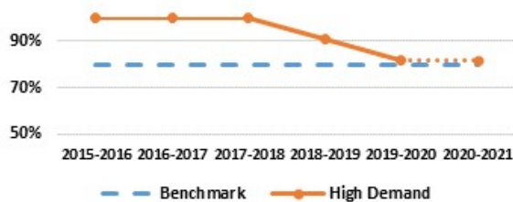
Percent of Transfer Program Groups that Contain High Demand Occupations