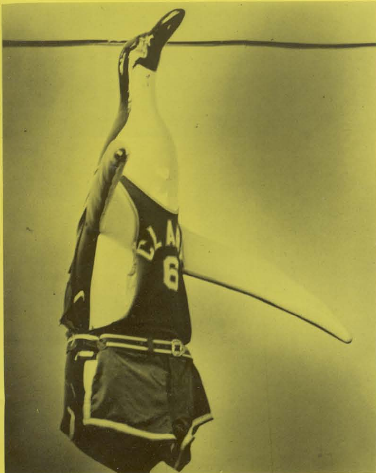
From there he finally hit his mark, Where he settled among us here at Clark.

There's an interesting legend about Oswald. Once upon a time Oswald lived on the frozen icebergs of the South Pole. Being an inquisitive penguin, he wanted life, adventure, romance, and, above all, an education. After searching his entire continent without success, he decided to explore the "Seven Seas" in hopes of finding happiness and an education. He asked everyone he met how to obtain an education, but no one seemed to know. He became so discouraged that he thought of going home to the frozen wastelands again, when he came to the beautiful tropical Galapagos Islands off the shores of South America. Here he found a happy life with other penguins and he was quite content, but he still wanted an education. One day in 1932 a vacationing Clark student came to the Islands and Oswald told him of his great desire, to learn. The student brought Oswald back to Vancouver to get that education. Before long the small student body decided that they should have an emblem which would be different and since Oswald had become such a favorite of the students, he became their official mascot. He's still at Clark in 1965 and, having obtained an education, now works full time promoting school spirit and pride. The events of Clark are kept in an annual called the GALAPAGON, which is named after the beautiful Galapagos Islands, in memory of where we got Oswald, the Penguin.