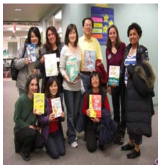
ESL students practice their English-speaking skills at the Read Across America event at Harney Elementary School

“I had a good experience reading....It was the first time for me to read a book in English in a public place.”