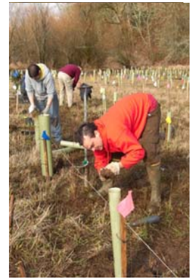
Students planting trees near Salmon Creek at the Weekend Expedition with the SLIC program.