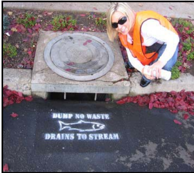
Clark College student shows finished product.

Volunteering, community service and service-learning all share in making a difference in the community. However, service-learning is part of an academic course and deepens student's knowledge of an academic field, increases critical thinking and positive citizen involvement. Through course readings, assignments, reflection and analysis students connect their service experience with academic theories and course learning outcomes.