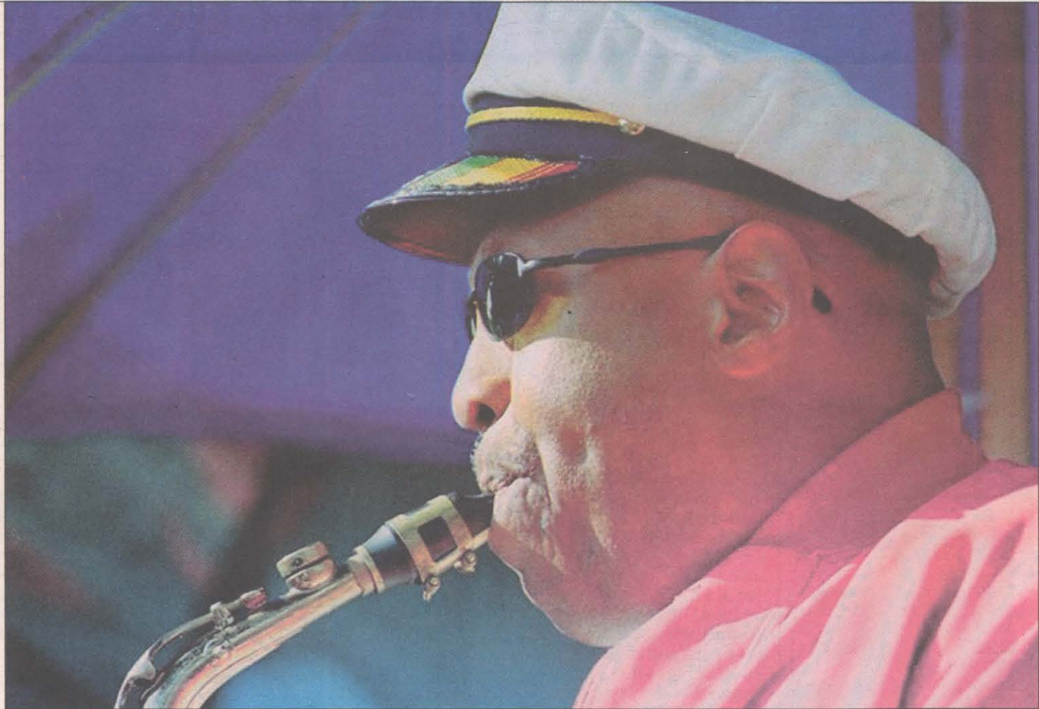
Alto saxophonist John Handy performs Jan. 29 at the conclusion of the Clark College Jazz Festival. Clark students will back up Handy during the final part of his performance.