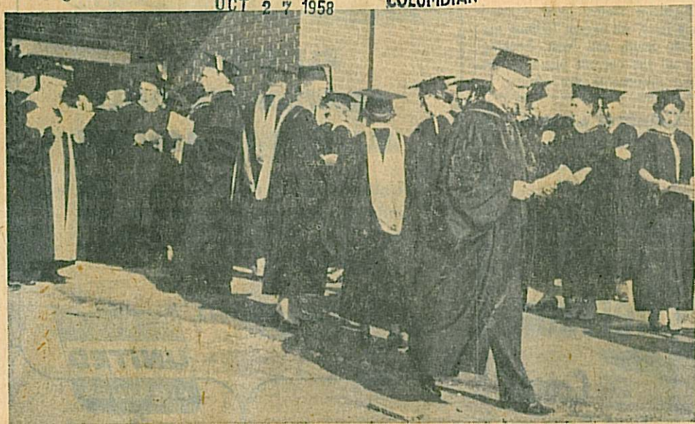
Forming the academic procession just before the start of Clark College's dedication and inauguration ceremony Saturday was this group of faculty and visiting college and university representatives. Many of the Pacific Northwest's institutions of higher learning were represented in the colorful procession which preceded the opening event of the day.